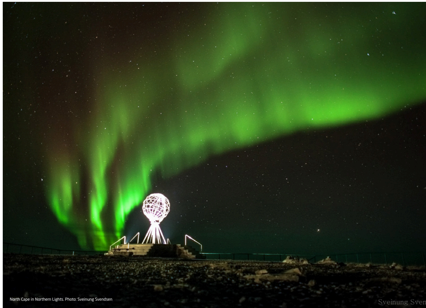
North Cape in Northern Lights.