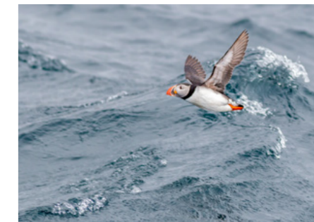
Birdsafari in Gjesvær.