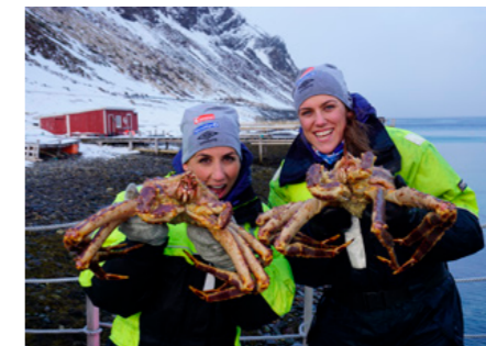
King Crab Safari.