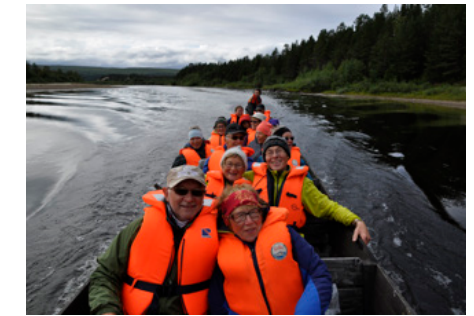
Riverboat in Karasjok.